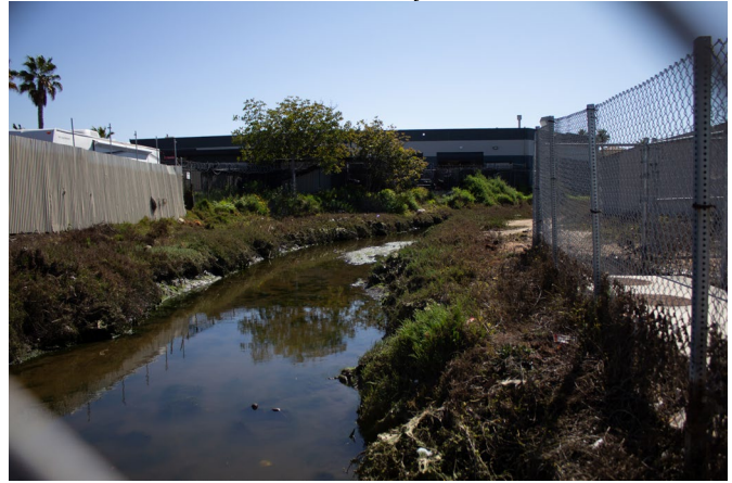
View of Paradise Creek adjacent to the Welding Shop on West 18th Street in National City. The creek is prone to flooding due to king tides and heavy rain events.